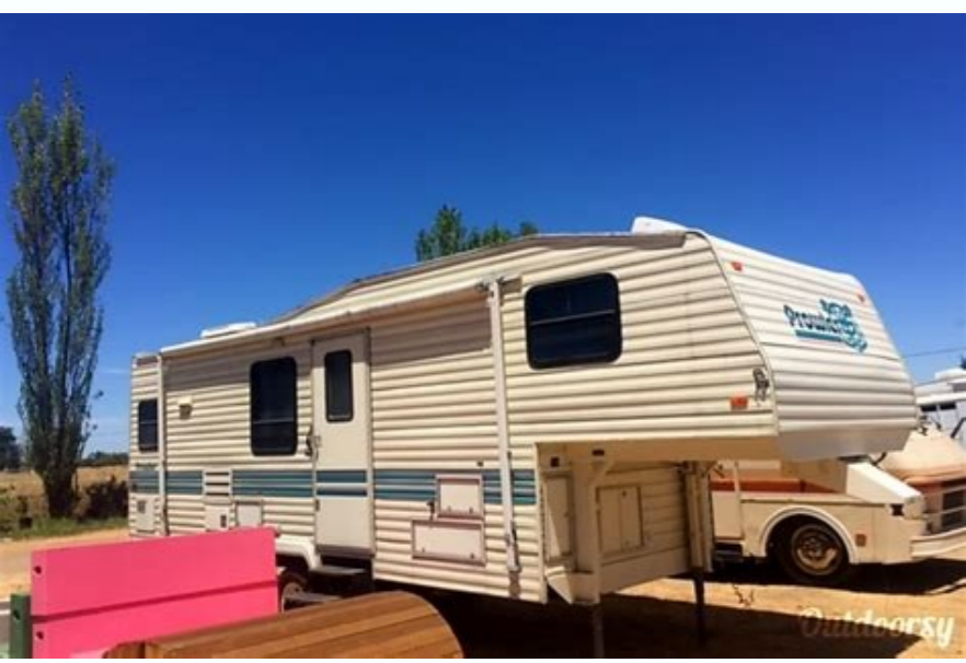
Save this Book to Read Fleetwood wilderness travel trailer owners manual PDF eBook at our Online Library. Get Fleetwood wilderness travel trailer owners manual PDF file for free from our online library.